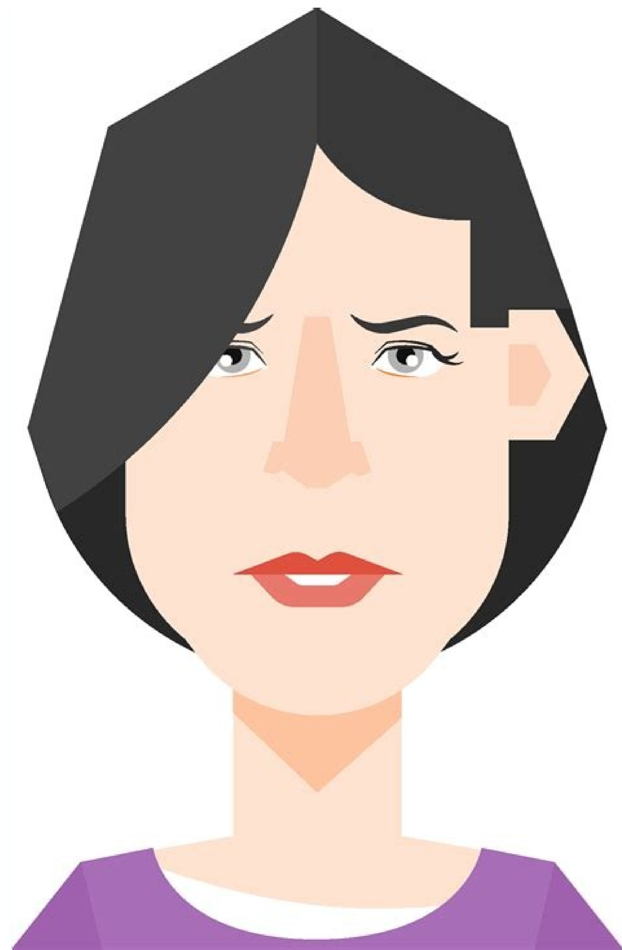
Articulate storyline training brisbane. Articulate 360 free.